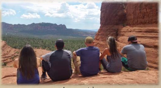
Arrangements by Evans Funeral Home - Carrington & New Rockford, ND www.EvansFuneralHomeND.com