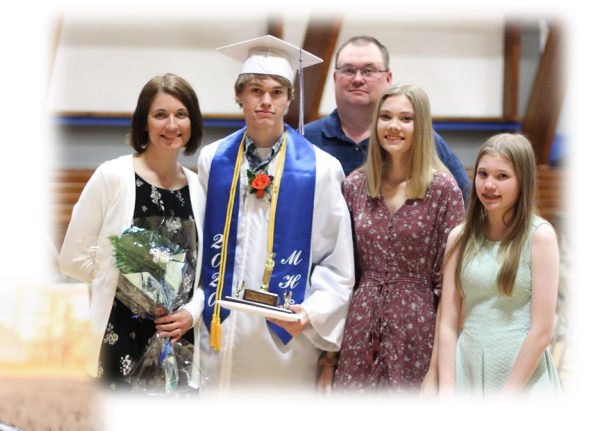
Your memory a Treasure.