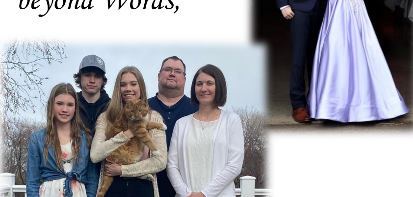
And will be missed beyond Measure.