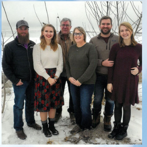
Your memory a Treasure.